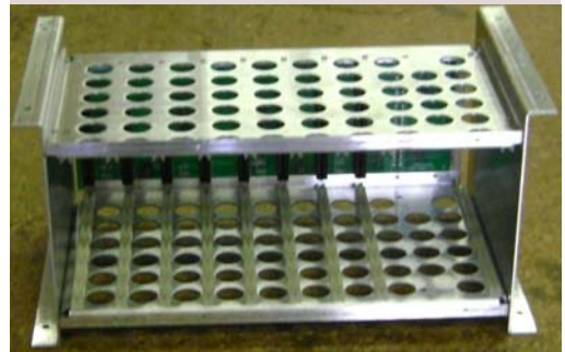
Optional Generator Socket